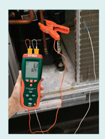
Take differential temperature readings with dual Type K thermocouple probes. Shown above with bead wire Type K thermocouple probe (included) and optional TP200 Type K Pipe Clamp Probe.