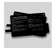
Battery Operation (Optional)