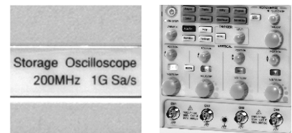
1GSa/s Real-Time Sampling

Battery operation option with typ. 3 hours of running time gives a much-desired mobility. built-in self-calibration and probe compensation help maintaining maximum accuracy even when environment or testing accessories changes. Language support helps you collaborating in multicultural working environments.