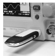
USB Flash Drive