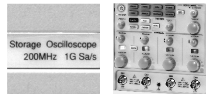
1GSa/s Real-Time Sampling

Battery operation option with typ. 3 hours of running time gives a much-desired mobility. built-in self-calibration and probe compensation help maintaining maximum accuracy even when environment or testing accessories changes. Language support helps you collaborating in multicultural working environments.