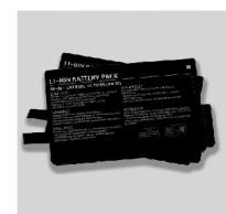
Battery Operation (Optional)