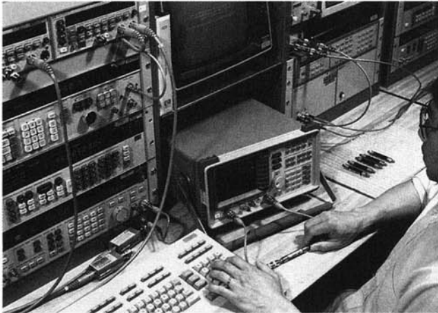
HP 8590 series RF spectrum analyzers have built-in tracking generator option.