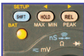
Easy to Understand Interface