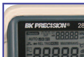
Back Lit LCD (2890A only)