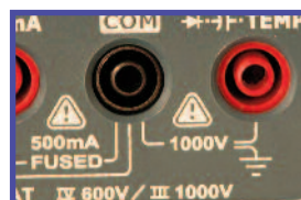
IEC Rated Inputs