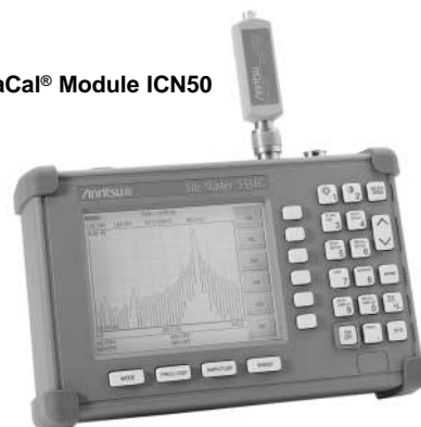
InstaCal® Module ICN50

*The InstaCal® Calibration Module exhibits slightly degraded directivity performance compared to precision loads. Users having applications that require DTF-RL measurements > | 38 dB | may want to consider using precision load calibration components in place of the InstaCal calibration module for greater measurement accuracy.