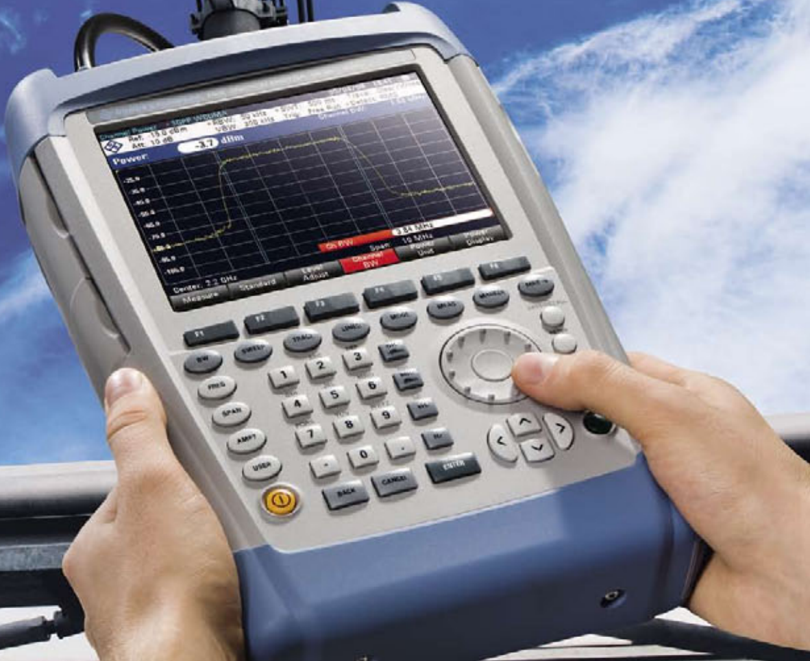
FIG 1 Testing a wireless communications base station with the new R&S®FSH8 handheld spectrum analyzer.