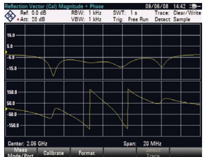
FIG 2 Simultaneous display of magnitude and phase in split-screen mode.

New hardware and software control elements and an even more straightforward menu structure further simplify operation. For example, you can now directly access limit lines and important marker functions. The selected function can be activated immediately by pressing the Enter key in the rotary knob. The MODE key makes it easy to switch between operating modes, e.g. spectrum analyzer, vector network analyzer or power meter mode. Due to the instrument's vertical design, you can securely hold it in both hands and yet easily reach all control elements. Pressing the "camera" key will produce a screenshot of any desired content and store it as a graphics file for the purpose of documentation. New customers can quickly learn how to operate the R&S®FSH, and customers who already use a first-generation analyzer can easily find their way around in a familiar environment.