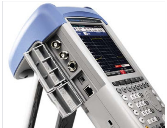
FIG 4 Additional connectors, e.g. for LAN and USB, are protected by caps.

To check the antenna matching and the power amplifiers, the analyzer models with a tracking generator and a VSWR bridge can be converted to a vector network analyzer simply by installing the relevant software option. Antenna matching and the transmission characteristics of filters and amplifiers can thus easily be determined in the forward and reverse