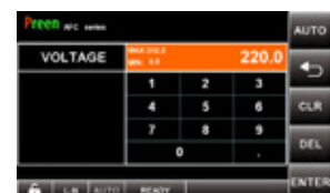
Voltage setting page

The AFC series features a large touchscreen for precise parameter adjustments and remote control via RS-232 and RS-485 interfaces. The display provides real-time monitoring of voltage, current, and power factor, with six customizable hotkeys for quick access to common settings. Additionally, the AFC series offers effortless switching between phase-to-phase and phase-to-neutral connections with a single click.